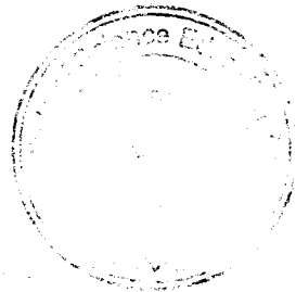
Superintending Engineer (Civil) IISER TVM

The filled & duly signed Quotation documents and Schedule of Quantities (SOQ) should always be placed in sealed cloth lined cover super-scribing the name of work will be received in the Office of the Superintending Engineer (Civil), IISER TVM, Maruthamala P.O., Thiruvananthapuram-695551 Up to 17-05-2021 at 15.30 Hrs and will be opened by authorized officer of IISER TVM on 17-05-2021 at 16.00 Hrs in the presence of tenderers or their representatives who would like to be present. In case of representatives the Authorization letter should be produced to within the tender opening.